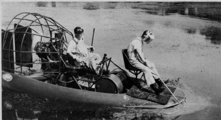
Most common method of aquatic pesticide application is airboat.