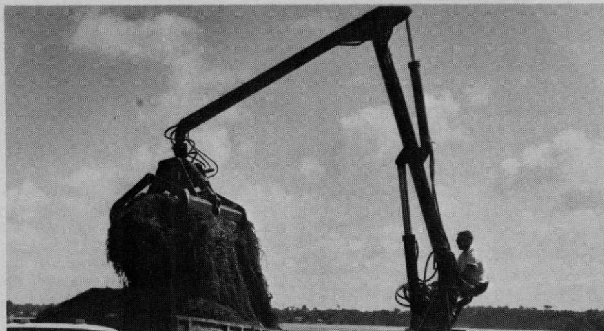
Sheer volume is a major problem with mechanical harvesting of aquatic weeds.

The USDA-ARS group is most active in this aspect of aquatic weed work, having endothall, dichlobenil, 2,4-D, amitrole, TCA, ametryne and acrolein under test either as direct application to water or as indirect application associated with ditchbank spraying. Dyes have been used to