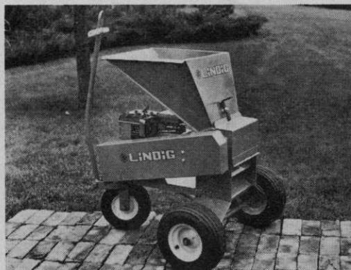
LINDIG KAJON CHOPPER

To Dispose Of Your Branches, Stalks, Vines, Trimmings