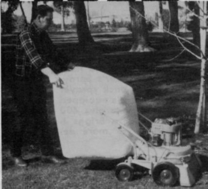
Some Mfg. Rep. Territories Available.

For More Details Circle (112) on Reply Card