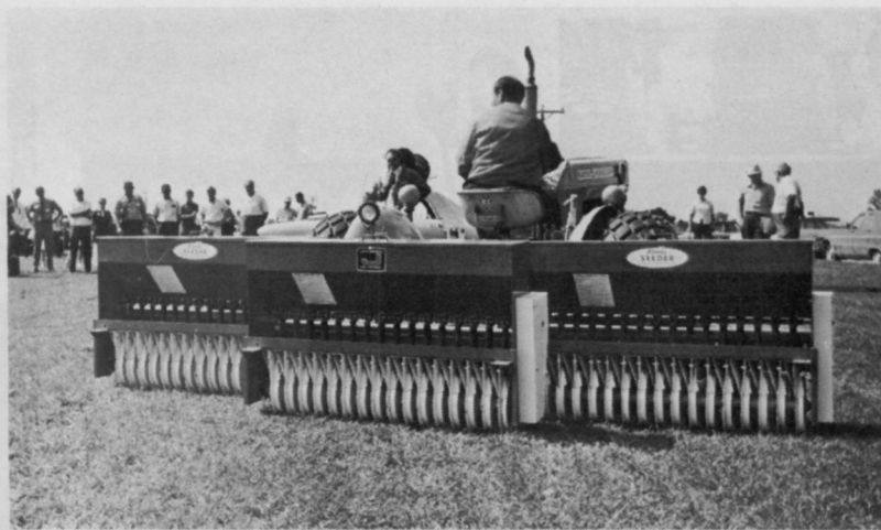
Wide-swath coverage in seeding and fertilizing was the feature of this equipment shown and demonstrated at the American Sod Producers Association. The spreader at left, distributed by O. M. Scott & Sons, Marysville, Ohio, lays down a strip of fertilizer about 30 feet wide. Jacobsen Manufacturing Co., has ganged the Rogers Seeder it bought recently and offers hydraulic lift capability for turn-around and transporting.