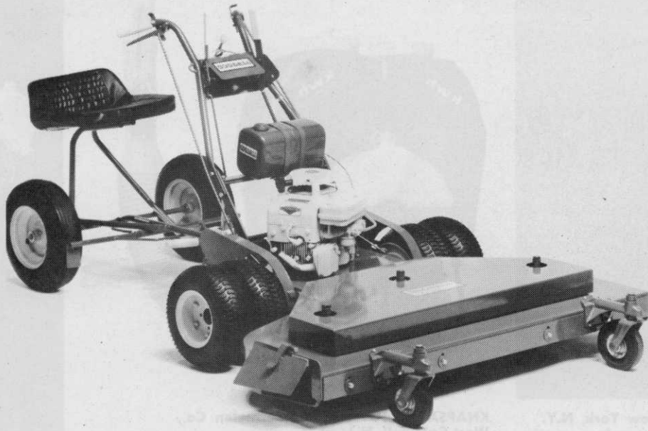
COMMERCIAL ROTARY MOWER, Goodall Division, Louisville, Ky.

Any operator, young or old, can do a better mowing job and do it faster, riding or walking, as conditions and safety permit. Fingertip power steering makes this 52-inch the most maneuverable and easiest to use, high capacity, commercial rotary mower. Mows steep grades, heavy grasses, cuts its own width and trims close with both sides. All three blades rotate clockwise with discharge chute on right side to mulch clippings evenly. Short wheelbase lets this "big" 52-inch cut and turn shorter than some 24-inch mowers. Dual wheels and brakes are standard equipment. Models also available in 21, 28, and 36 inch cutting swath. For more details, circle (711) on the reply card.