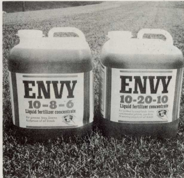
LIQUID FERTILIZER CONCENTRATE, National Liquid Fertilizer Corporation, Chicago, Ill.

A new feature of the mechanical weed harvesting system from Aquamarine allows one-man operation of the H-650 aquatic weed harvester and the S-650 shore conveyor. The operator maneuvers the weed-filled harvester into the coupled position (as shown) with the shore conveyor. He then can go ashore to start up the hydraulically operated, two-section shore conveyor. Through the use of electrical, shore-mounted remote controls, the operator can convey weeds from the harvester into a truck at the rate of four tons per minute. The complete "Aqua-Trio" consists of the above two units plus a third barge-mounted unit, the T-650 transport. For more details, circle (709) on the reply card.