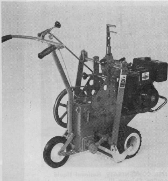
18-INCH SOD CUTTER, Ryan Equipment Co., St. Paul, Minn.

New epoxy finish that promotes equipment longevity and makes cleaning easier is a new feature of the Diadem spreader and seeder. The unique anti-corrosion and rust-proof epoxy over coating is designed to last a lifetime. Centrifugal spinner capable of spreading powder, seeds and granular fertilizer in 50-ft. swath. The Diadem is ideal also for applying herbicides, salt and sand. For more details, circle (712) on reply card.