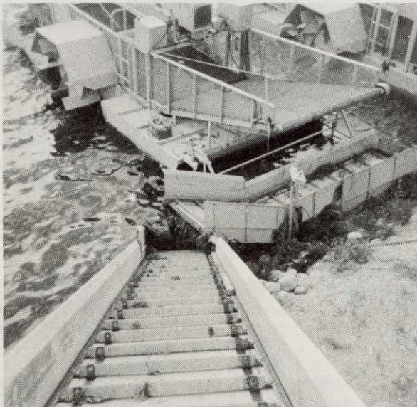
SHORE CONVEYOR: Aquamarine Corporation, Waukesha, Wis.

The KWH-66TT is a combination mistblower and duster. It features a powerful blower capable of generating 480 cfm of air at 225 mph. The unit weighs 23 lbs. and disperses dust, wet dust and granules. Spray will reach 40 ft., granules 30 to 40 ft. Controls allow fine metering with positive, instant shut off. Each tank holds 1.6 gallons. Dust capacity is about 15 lbs. The KWH 66TT is the only power knapsack that can apply a liquid spray and a dry dust together in one operation. Dust and atomized liquid mix outside of the patented KWH "non-clog" nozzle before reaching the plant. For more details, circle (708) on the reply card.