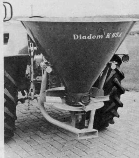
DIADEM SPREADER AND SEEDER, Vander-molen Corp., West Caldwell, N.J.

Any operator, young or old, can do a better mowing job and do it faster, riding or walking, as conditions and safety permit. Fingertip power steering makes this 52-inch the most maneuverable and easiest to use, high capacity, commercial rotary mower. Mows steep grades, heavy grasses, cuts its own width and trims close with both sides. All three blades rotate clockwise with discharge chute on right side to mulch clippings evenly. Short wheelbase lets this "big" 52-inch cut and turn shorter than some 24-inch mowers. Dual wheels and brakes are standard equipment. Models also available in 21, 28, and 36 inch cutting swath. For more details, circle (711) on the reply card.