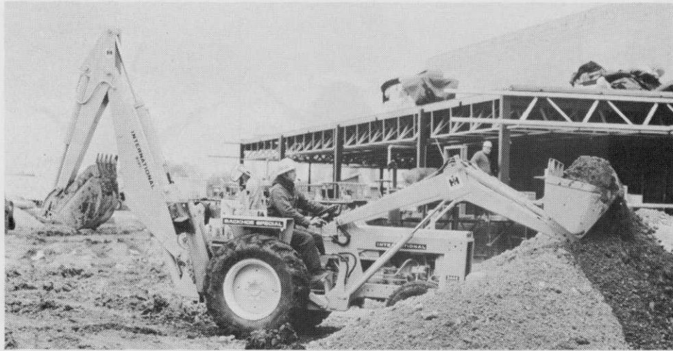
This IH 3444 Backhoe Special was among the 1970 equipment line shown at Louisville, Ky., fairgrounds. The \frac{3}{4} -yd. loader tractor with 12½ or 14½ ft. backhoe is furnished with a 73.4-inch-wide loader bucket and a 24-inch trenching bucket. It is available with a 43.5 gasoline or diesel engine, mechanical-shuttle or Hydra-Shuttle (power shift) with Torque Converter transmission.