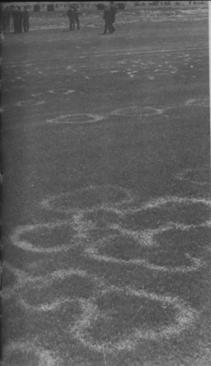
Some evidence of disease was found, such as Fairy Ring above, but most damage was caused by a high temperature period followed by a hard freeze.

there's just no way to cover our costs."