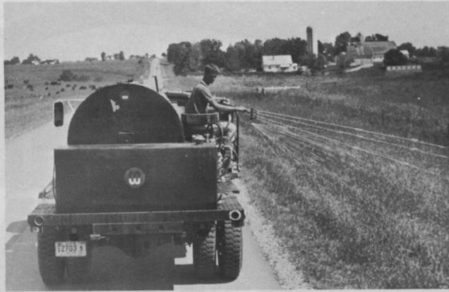
Several scenes from Hercules' "Visko-Rhap" film illustrate new methods and equipment used in applying the emulsion herbicides.