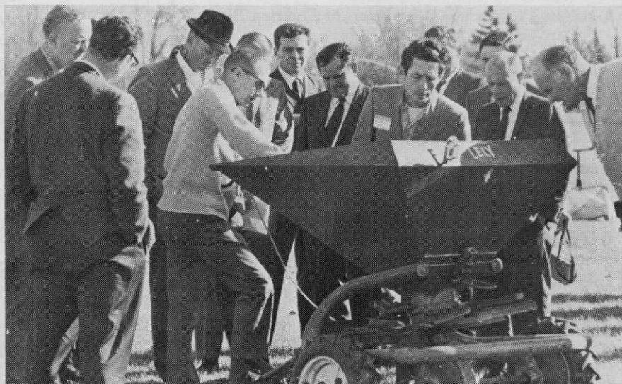
As sod growers and golf turf specialists look over this fertilizer spreader, compare the difference in dress with the picture above. After a cold cloudy start, the seminar ended sun-shiny and warm.

Seminar guests inspected plots showing the improved response that Scotts ProTurf fertilizer formulations in the Polyform process achieved over earlier products. They saw demonstrations of variable