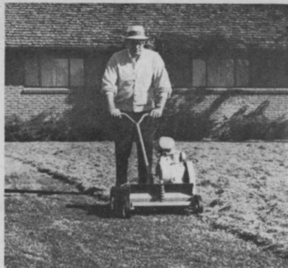
Ease of Performance is Unequaled. And Look at the Thatch It Combs Out!

The "Blue Bird" has seen many imitators since its inception. But no other has matched the response it has received from turf management personnel.