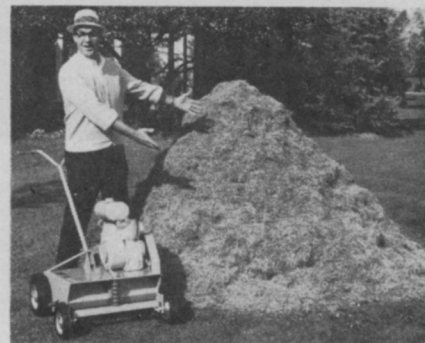
Your Customers Will Be Amazed at the Job the "Blue Bird" Does... So Will You.

of all. Better lawns, better turf management. Profit? Well, it just about goes without saying, the "Blue Bird" is the top profit pro-