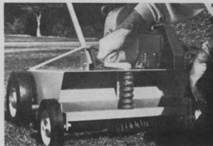
Simple, Efficient Height Adjustment Raises or Lowers the Rotor to Fit the Job.

ducer. High performance, virtually no maintenance. Figure it out... isn't the "Blue Bird" the unit you want to use to eliminate the thatch problem?