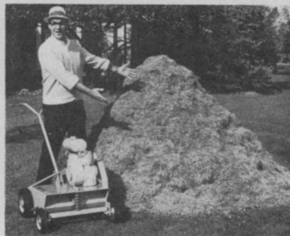
Your Customers Will Be Amazed at the Job the "Blue Bird" Does... So Will You.

of all. Better lawns, better turf management. Profit? Well, it just about goes without saying, the "Blue Bird" is the top profit pro-