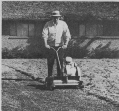
Ease of Performance is Unequaled. And Look at the Thatch It Combs Out!

The "Blue Bird" has seen many imitators since its inception. But no other has matched the response it has received from turf management personnel.