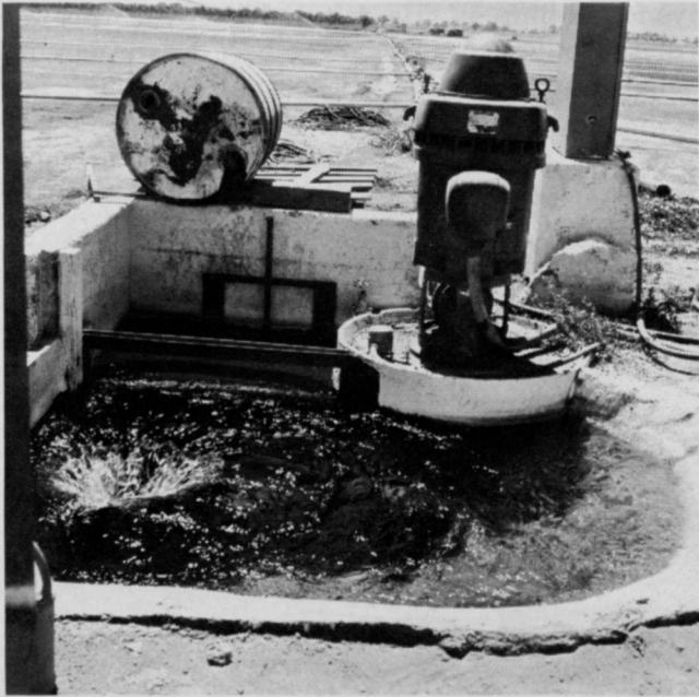
Turbine booster pump is one of three used by Nunes. Sprinkling system opens off 8-inch mainline with 3- and 4-inch laterals.

brid bermudas, bentgrass, and dichondra.