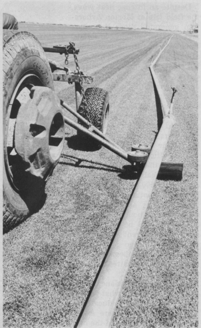
Moving irrigation line allows mowing and maintenance. Sod here is Windsor Blue. John Nunes developed pipe mover.