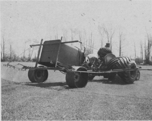
Terra tires present no problem when pulling 200-gallon sprayer used by Gunn. Small steel wheels were custom fabricated.