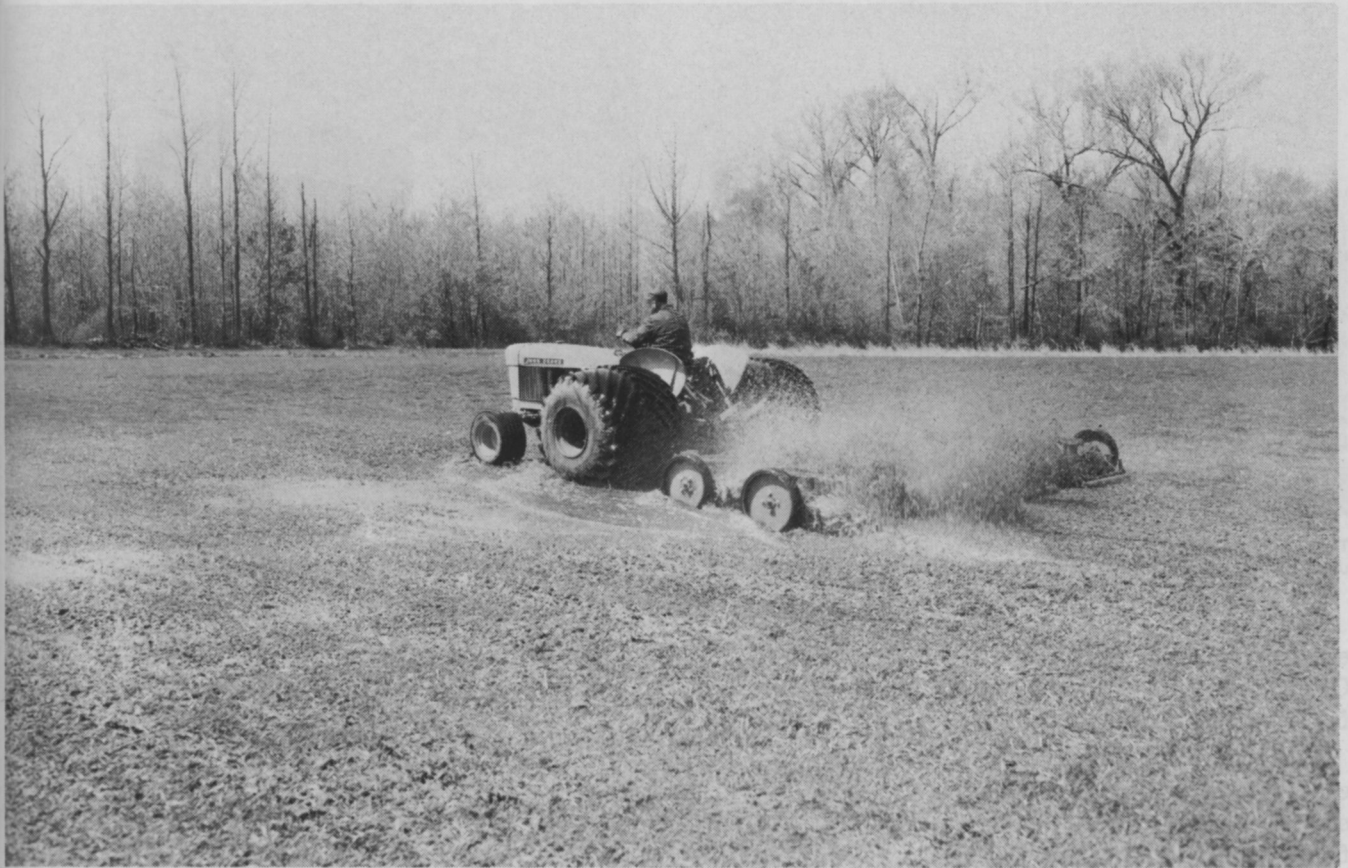
Much of the acreage of sod at Blue Grass Lawn Farms is under water following a heavy rain. Even though ground is wet, mowing is seldom a problem with the wide rubber tire type of equipment.

lem by fabricating 48-inch wide by 48-inch diameter steel wheels. The steel wheels had the needed flotation, but little traction over the wet slick ground or during mowing operations. Gunn mows every other day.