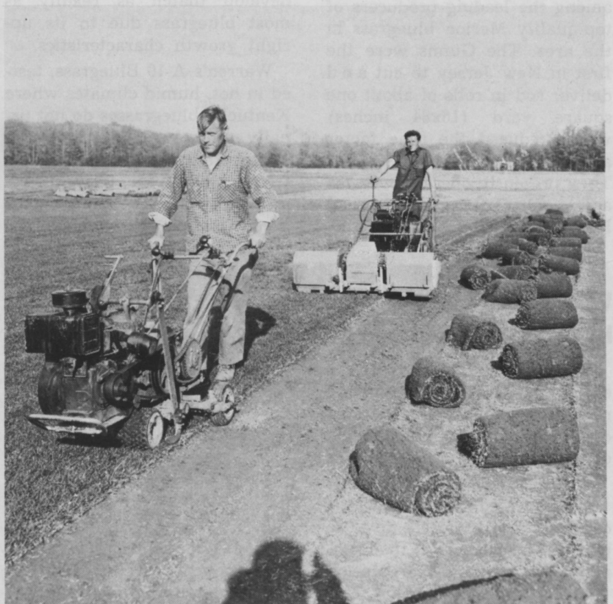
With early spring sod care problems solved, cutting and rolling good sod is relatively simple, according to Gunn. Sod is cut 16" x 84" with Ryan cutter and rolled with Ryan roller.

Gunn explained that many turf growers have to resort to use of helicopters for spraying in order to fertilize sufficiently during the growing period. "We