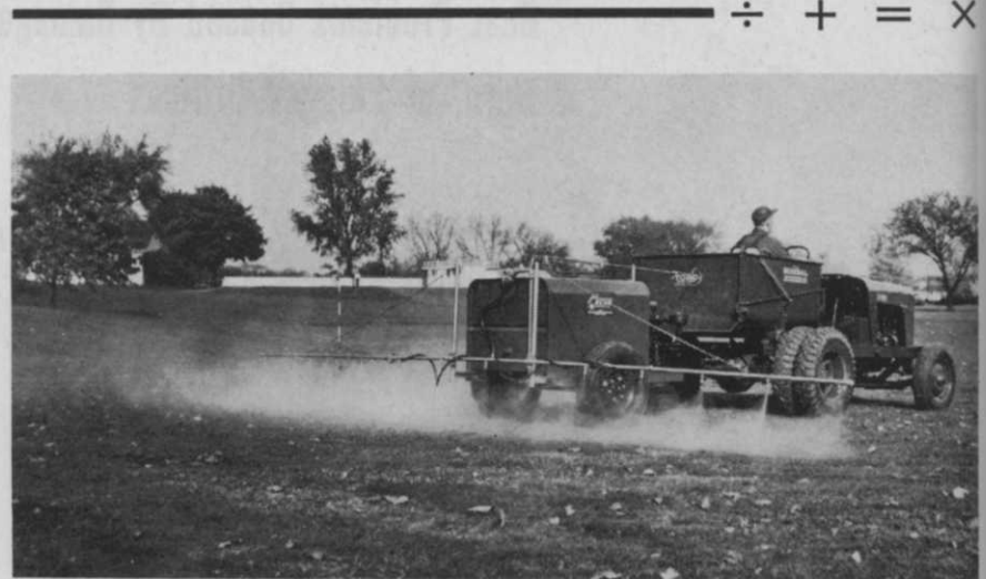
With nozzles set to spray at 65 degrees, this boom spray system delivers even coverage with little drifting caused by wind. Boom is 22 inches from the ground.

First then, the GPA per nozzle (GPAPN) must be determined. Assume for example, that we are using a boom with 13 nozzles, spaced 14 inches apart (W). From previous calculations, we know ground speed is 4 MPH. In this instance, your turf