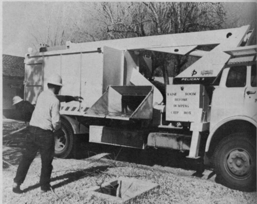
Salt River Project group incorporated telescoping aerial device, dumpbox, and brush chipper into one unit to provide crews with total mechanization.

Although the most acceptable power source for tools is the hydraulic power of the unit itself, many users have equipped their units with pneumatic power as well. Their argument in favor of the dual power source is that productivity is not lost should a malfunction occur in one of the systems. The power source for the pneumatic tools is found in