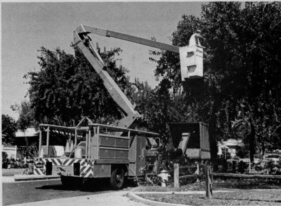
Whittier, Calif., municipality automated municipal tree trimming program by eliminating climbing. In operation is 46' insulated aerial device.

What was once a three-unit fleet of related equipment required for normal tree trimming jobs has been integrated into one