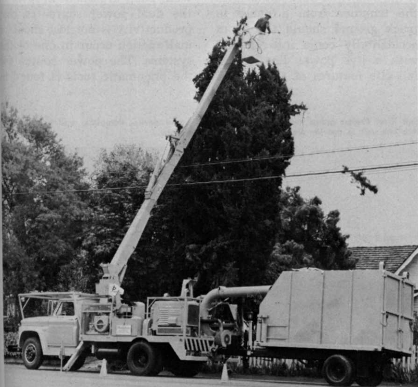
Progressive utility on west coast is using 40 units such as this mechanized package, above. Two-man unit includes aerial lift mounted on standard truck chassis, 41-foot Pitman Hotstik aerial unit with insulated aerial device. Chipper, mounted on truckbed, blows chips directly into special trailer.

Today's tree trimming crew requires a sizeable investment in modern equipment. Progressive departments have made this investment in order to meet rising workloads with basic work forces. The few hundred dollars