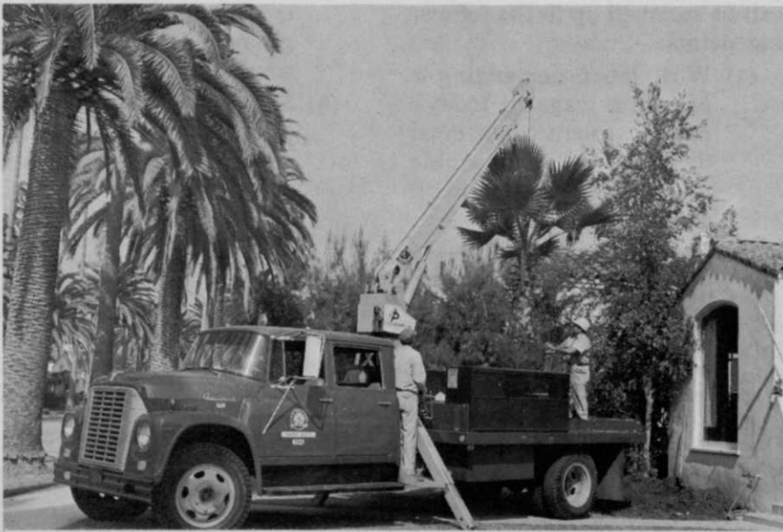
Relocating trees is but one of many jobs handled with Hydra-Lift crane used by Beverly Hills, Calif., Park Department.

To relieve these problems and add efficiency to its trimming operation, SRP, working with Pitman Manufacturing Company, designed a combination chipper-chipbox-and aerial device, all mounted on one vehicle. The 3-in-1 tree trimming package was installed on a standard tilt-type chassis. The aerial unit, a Pitman PELICAN II telescoping boom, was mounted directly behind the cab followed by a brush chipper on the curbside of the chassis. A discharge chute was installed between the chipper and a dump type chipbox was mounted on the rear half of the truck. In the road travel position, the boom stows over the chipbox and is supported by boom rest on the top side of the box. The throat of the chipper blower fits into grooves on the chip box, detaching automatically as the box is raised. A single power-take-off operates both the boom and the chipper.