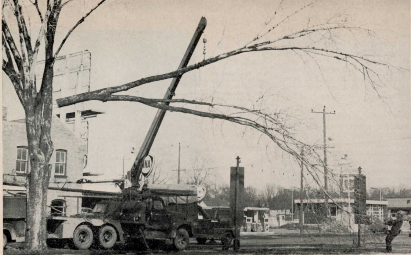
Using truck mounted crane, Ontario tree trimming contractor, Andy Hamilton, removes entire sections of tree in single cut. Without crane, method would be impractical on removal projects near power lines and buildings.