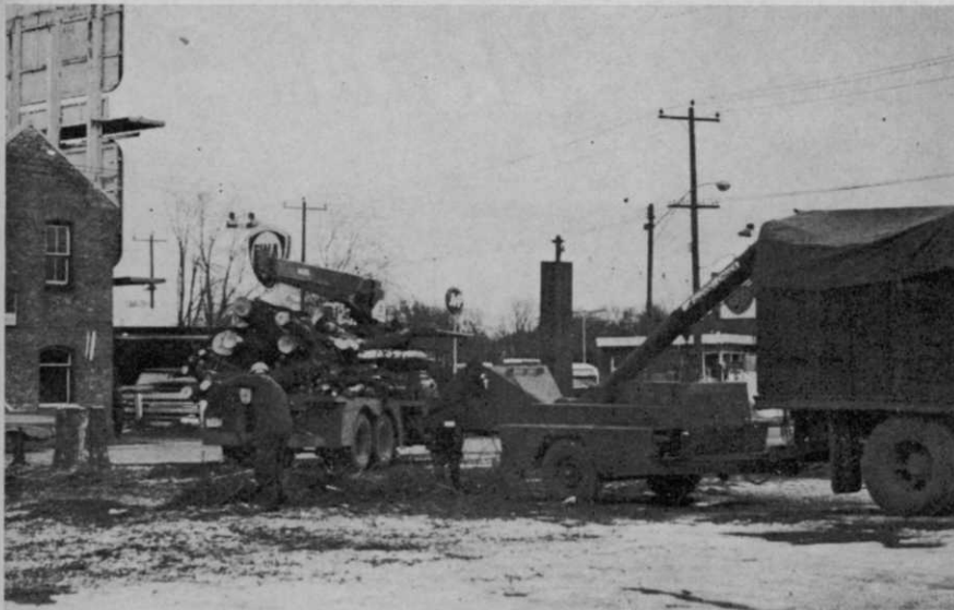
Two men handle removal job in less than 2 hours. Stump, logs, and chips are all that remain of 85-foot tree. Hamilton says mechanized equipment makes this type operation possible.

saws, a 12-inch brush chipper, and a chip truck.