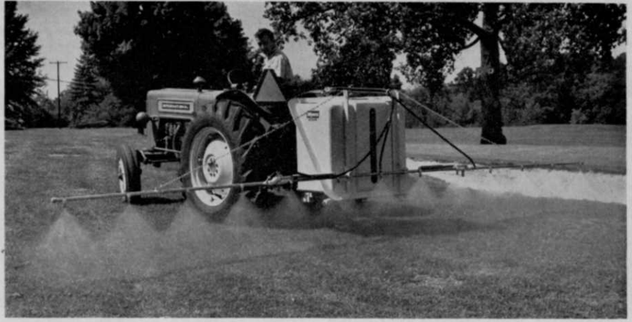
100TM - Tractor-Mounted, 100 Gallon, PTO Sprayer

With these officers at the helm, the Northeastern Weed Control Conference plans to hold its 22nd annual meeting on January 3, 4, and 5, 1968. Again, New York City's Commodore Hotel will be the site, and for three days out of the year at least, weed control capital of the Northeast.