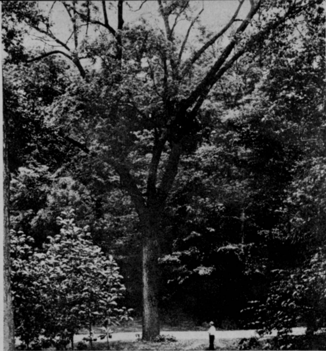
This black walnut tree is one of the best known trees in Ohio and is located in Walnut Hollow of the Secrest Arboretum. Estimated age is 175 years and bids by contractors as a timber tree have ranged up to $1500, though the tree is not for sale. It will remain a forest giant for posterity.