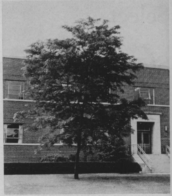
Moraine Honey Locust, Gleditsia triacanthos inermis Moraine. Plant patent 836. Age, 19 years; height, 32 feet; diameter, 7.3 inches; crown spread, 30 feet. Located on OARDC campus, Gourley Hall.