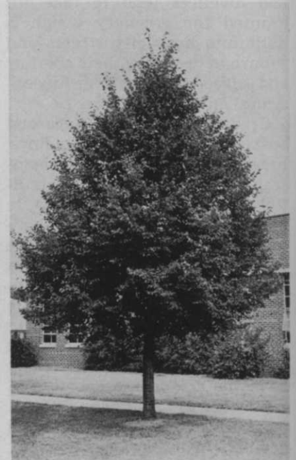
Little-leaf European Linden, Tilia cordata . Age, 13 years from seed; height, 26 feet; diameter 8.4 inches; crown spread, 19 feet. Located on OARDC campus, Maintenance building.