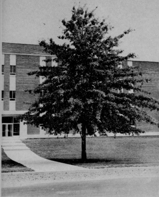
Pin Oak, Quercus palustris . Age, 17 years from seed; height, 37 feet; diameter 11.8 inches; crown spread, 40 feet. Located on OARDC campus, Gerlaugh Hall.