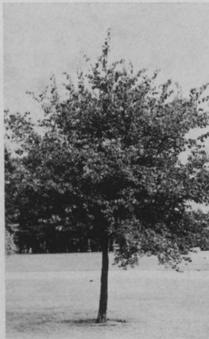
Washington Hawthorn, Crataegus phaenopyrum . Age, 19 years from seed; height, 16 feet; diameter, 5.1 inches; crown spread, 16 feet. Located on OARDC campus, Gourley Hall.

locust, Texas red oak, pin oak, sweet gum, ginkgo, little-leaf linden, and Washington hawthorn. Others of the newer cultivars of maples, oaks, lindens, and flowering trees could well be in-