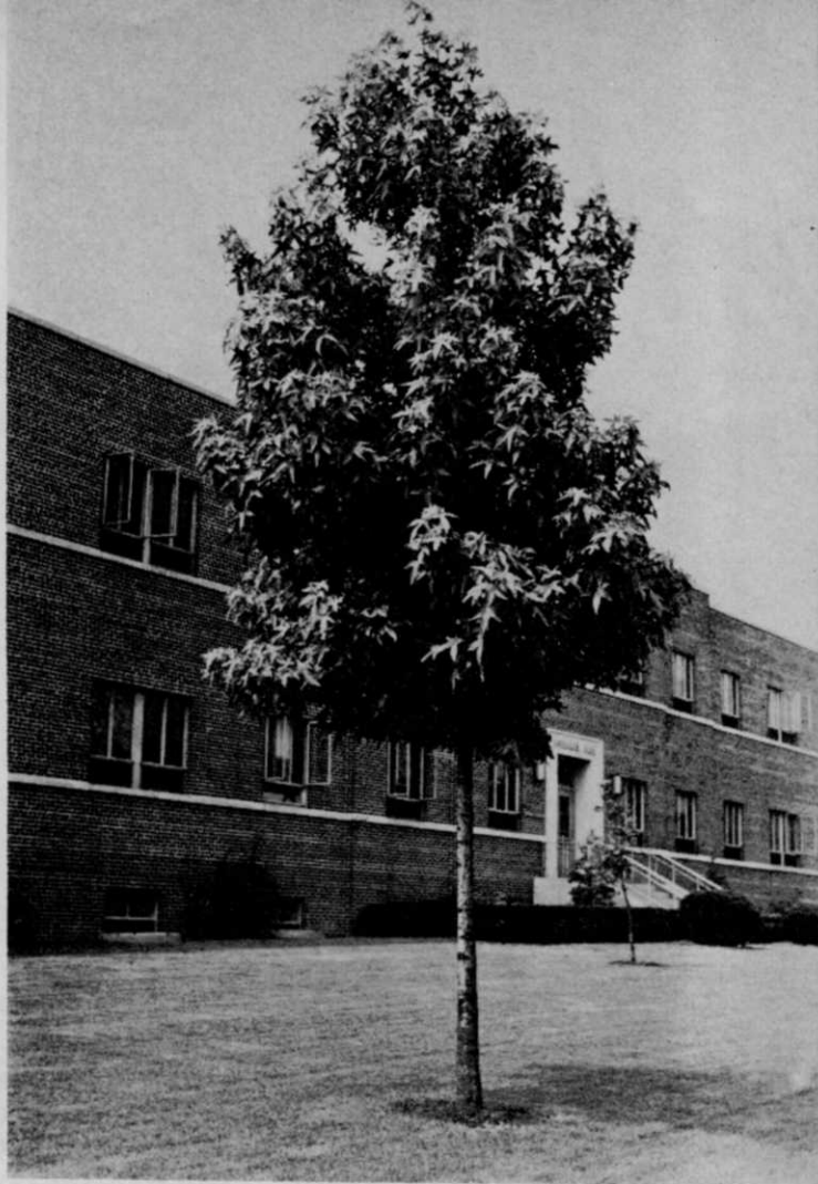
Sweet Gum, Liquidambar styraciflua . Age, 16 years from seed; height, 21 feet; diameter, 4 inches; crown spread, 13 feet. Located on OARDC campus, Williams Hall.

Golden-rain Tree, Koelreuteria paniculata . Age, 15 years from seed; height 13.5 feet; diameter, 7.7 inches; crown spread, 16 feet. Located on OARDC campus, Gourley Hall.