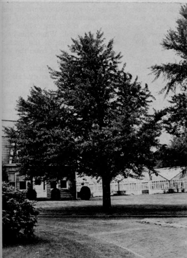
Ginkgo, Ginkgo biloba . Age, 58 years from seed; height, 48 feet; diameter, 22.9 inches; crown spread, 48 feet. Female tree, though fruitless male trees are preferred.