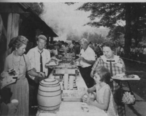
Above: Conventioneers pass through lunch line at Holden Arboretum barbeque. Below: Overall view of commercial exhibit area in convention headquarters hotel.