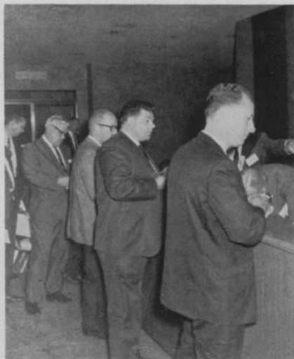
Delegates sign in for the six-day long Shade Tree Convention.