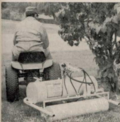
Liquid weedkiller drips onto "The Drip's" 36-inch applying roller which in turn presses it onto undesirable weeds without "drift" to shrubs, Lakes Supply claims.

Complete details on "The Drip" will be sent if you write the Lakes Supply Co., Inc., P.O. Box 101, Dundee, Ill. 60118.