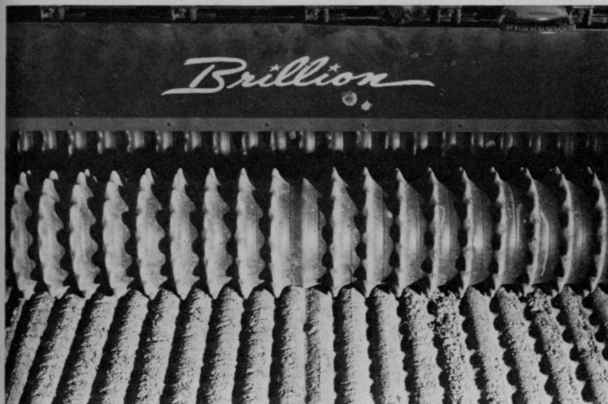
Figure 4. Another type of seeder in popular use showing close-up of soil pattern after seeding made by this machine.

other soil-borne insects may produce serious damage to the stand of turfgrass. Application of appropriate insecticides while preparing seedbeds will provide assurance against grubs. At present, the New Jersey Department of Agriculture requires soil insecticide treatment for interstate shipment of sod. Insecticides such as chlordane, dieldrin, aldrin, and heptachlor can provide long-lasting protection.