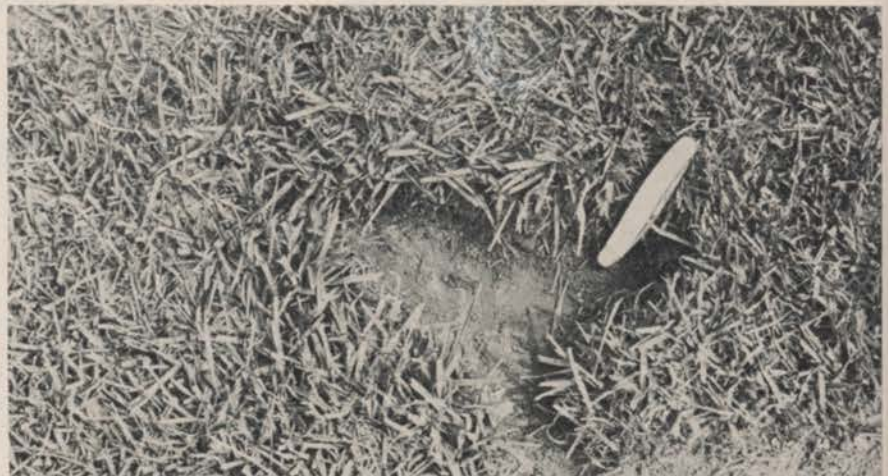
Figure 2. Lack of a uniform stand of the desired turfgrass has resulted in this type of condition in an otherwise high quality strip of harvested sod.

Realizing the importance of uniformity of stand of turfgrasses in relation to sod quality, sod growers should be overconscious of the principles and practices of sod production which aid