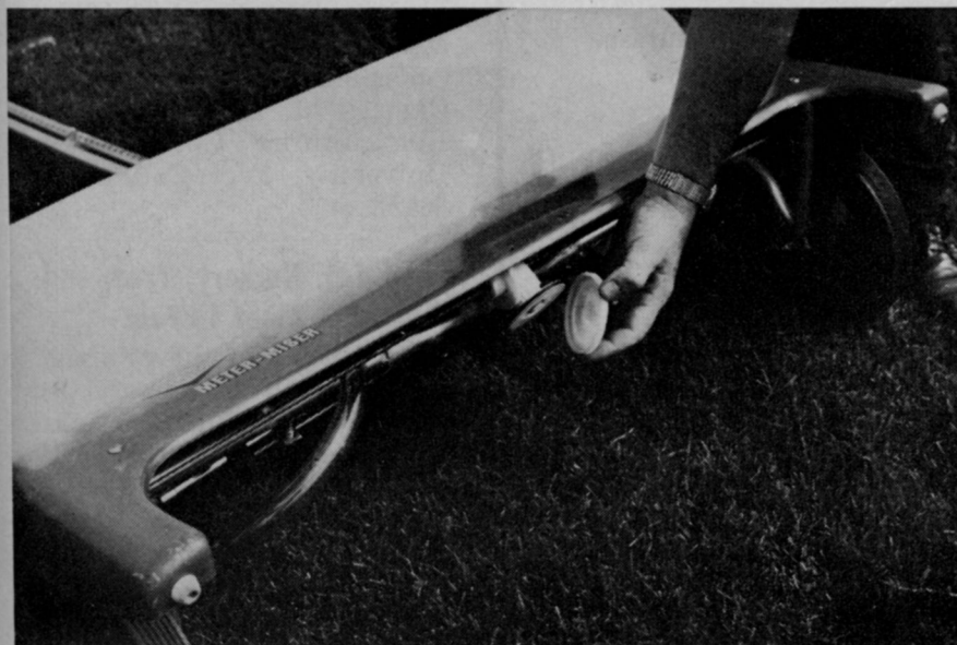
Non-corrosive plastic disc spinning under the hood of the Meter Miser applicator affords accurate dosage and drift-free operation. Design of the applicator disc coupled with the pre-measured liquid formula in the tank eliminates the need to calibrate the new chemical applicator.