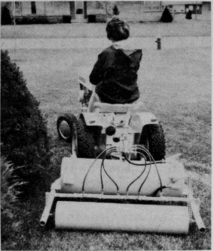
Liquid weed killer drips onto a roller of this Model 101 Commercial 36 inch Pull-Type Drip Roller Unit from Lakes Supply Co. Liquid transfers to ground as the applicator travels. This process eliminates spray drift and allows closer approach to flowers and shrubs, the manufacturer claims. Three models all have adjustable drip rate, filters, and pump gear. Lakes Supply Co., Inc., Dundee, Ill. is the distributor.

LANDSCAPING and tree expert business in highest income area in northeast. Annual volume $400,000, been in business 37 years, and enjoy high reputation for quality work. Owns equipment to handle any type of landscape or tree work. Office, warehouse and nursery may be purchased at buyer's option. Owner wishes to retire but will stay on for a limited time in a consultant capacity. Write Box 17, Weeds Trees and Turf magazine.