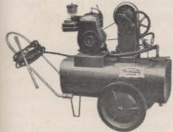
15-30 gal. Town & Country

Hardie has just the sprayer for your particular job, whether it be for mosquito control; combatting Dutch Elm disease; nursery work; contract lawn, tree & shrubbery service . . . Whatever your need may be . . . write to Hardie today, or call your local Hardie Dealer for more information or an on-the-spot demonstration.