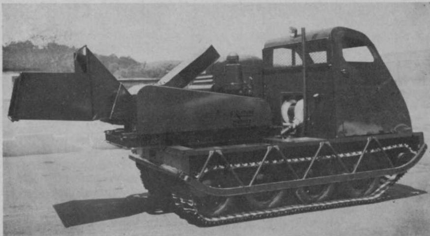
Snow, mud, or swampland are no obstacles to the Snowmobile-Fitchburg Chipper unit, which can be used year-round over all terrain conditions and in any kind of weather, Fitchburg Engineering Corp. says. The chipper converts wood up to 7 inches in diameter into chips and blows them out of the chute. Complete details may be obtained from the company in Fitchburg, Mass. The carrier vehicle, called the Muskeg Carrier, is manufactured by Bomardier Snowmobile Ltd. of Canada.