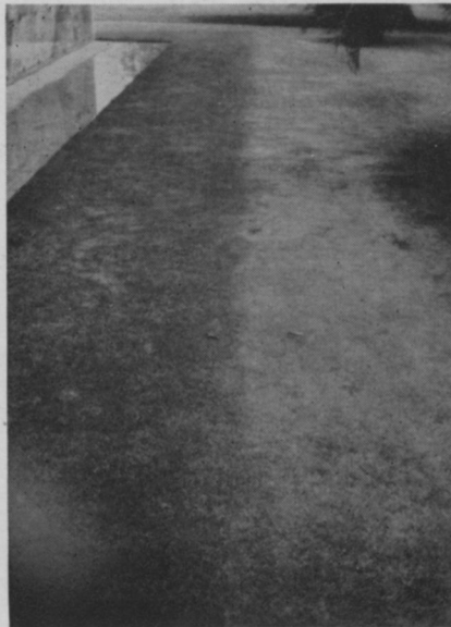
This drought damage to zoysiagrass was caused by nematode and mole cricket damage to roots. Areas protected from sun survived.

Dog damage. Brown spots which resemble disease damage are often caused by dog urine or feces. The grass in these spots often has a speckled appearance,