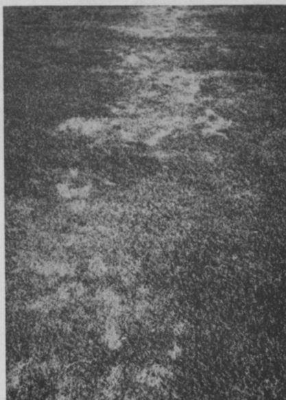
Chemical burns on this zoysia lawn in south Florida was caused by faulty equipment.

Consider all factors and arrive at the conclusion through the process of elimination. It should be pointed out that the symptom does not always indicate the cause. For example, the symptom may be a dry spot. Although water would correct this condition, the cause may be due to