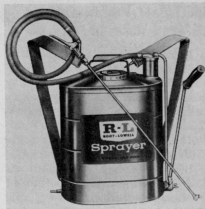
Said to develop pressures up to 100 psi, this knapsack-type sprayer is manually operated.