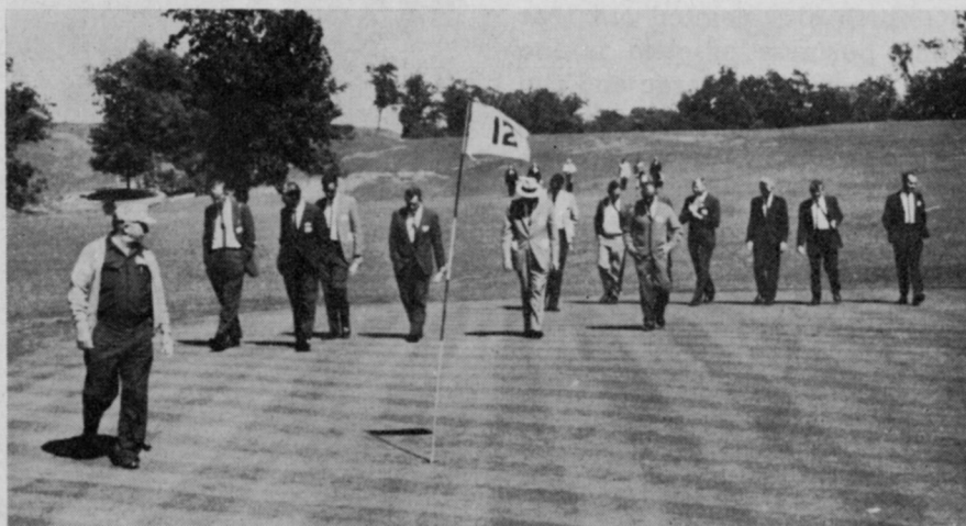
Highly cultured golf course turf was of interest to all turf management personnel at the University of Missouri conference.