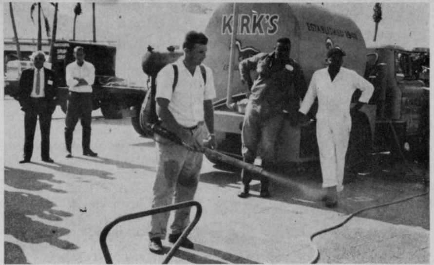
Equipment demonstration permitted delegates to wander at will and inspect spray rigs from this portable device to some heavy-duty, complex truck-mounted systems.