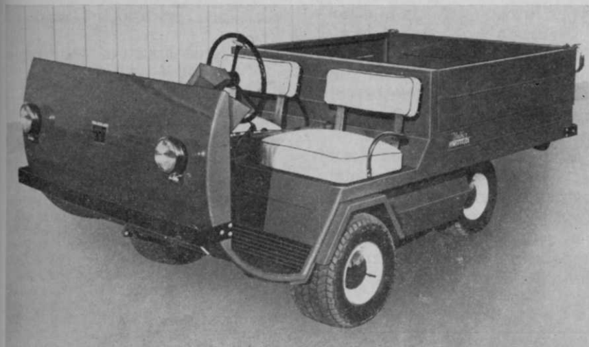
New Walker Power Truck, a small-wheel, multipurpose vehicle which is said to be useful as a rolling workshop, cargo hauler, or (with attachments) as a small dozer or rotary mower for turf, has just been developed.