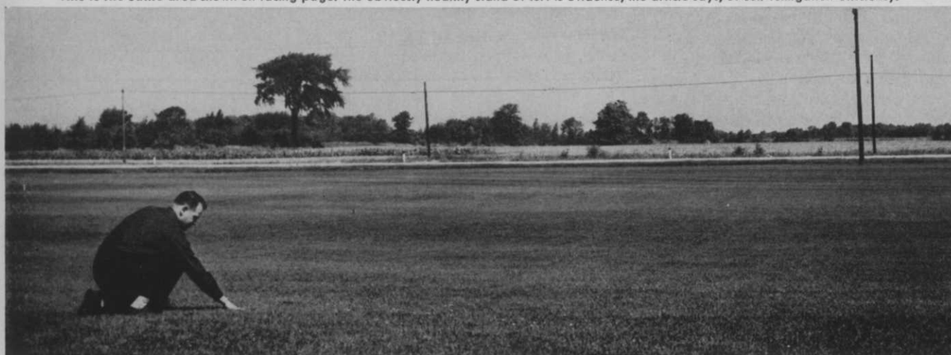
This is the same area shown on facing page. The obviously healthy stand of turf is evidence, the article says, of soil fumigation efficiency.