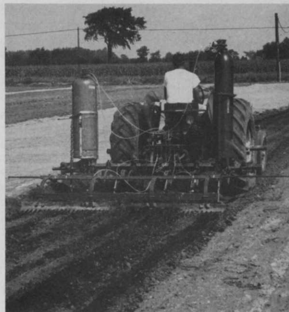
Tractor-mounted, chisel-type applicators, such as this, can be used to inject fumigants into soil before planting seed.

A plastic tarp is required to seal these fumigants in the soil, preferably within about 20 minutes following application. Where overall treatment of a large area is