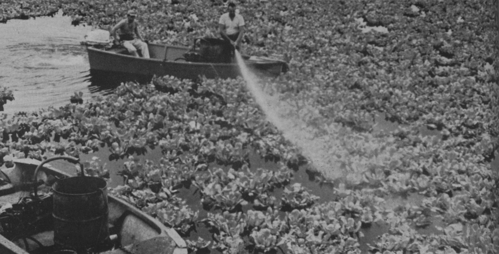
Simple boats can be pressed into service on aquatic jobs, frequently with great success.