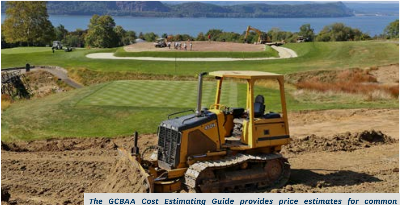
The GCBA Cost Estimating Guide provides price estimates for common construction expenses based on data from recent projects across the country.