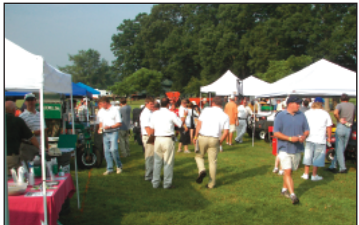
A trade show sponsored by SFMANJ welcomed attendees to the Lawn, Landscape, and Sports Field Day held at the Rutgers Adelphia Research Farm on July 30, 2008