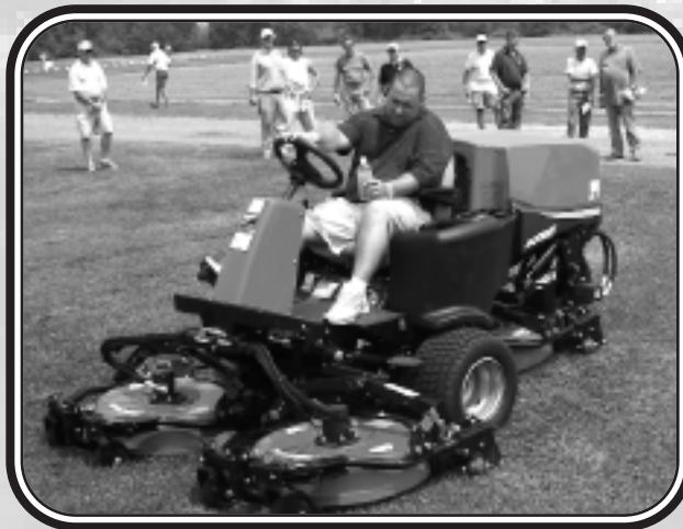
JACOBSEN AR-3; WILDRED MACDONALD, INC.