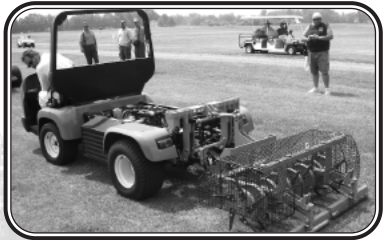
SISIS MULTISLIT; THE VIERSMA COMPANIES