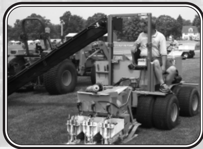
WATERWICK SLICE AND FILL; THE VIERSMA COMPANIES