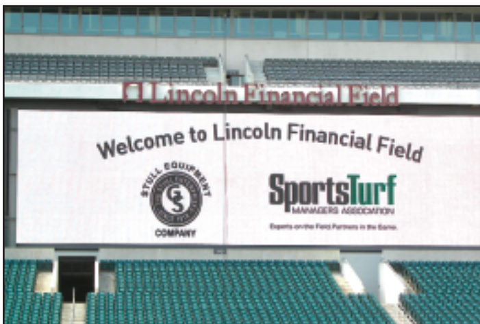
Lincoln Financial Field, Philadelphia, PA hosted a Summer Regional Conference sponsored by STMA on June 27, 2008.