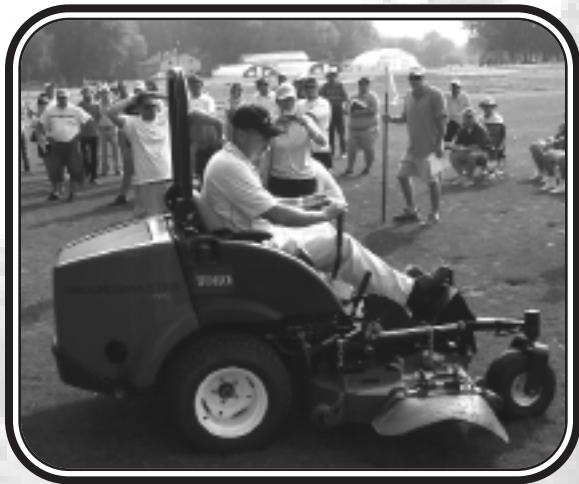
TORO GROUNDSMASTER 7210; STORR TRACTOR CO.

Adelphia, New Jersey - July 30, 2008 • 1