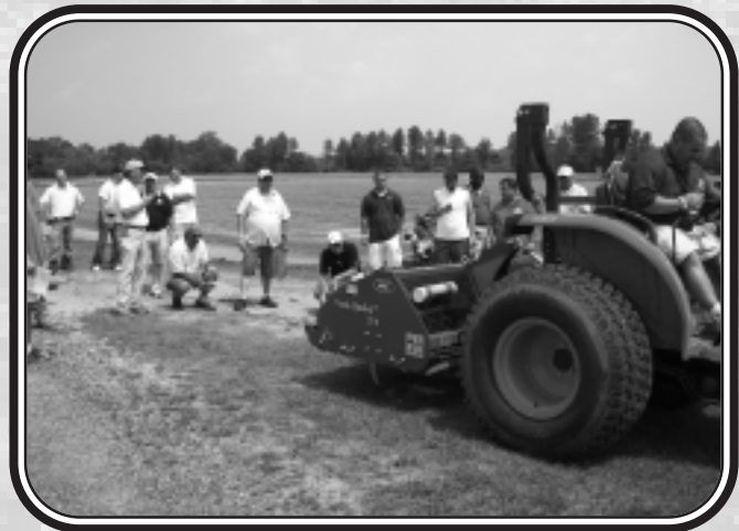
REXEXIM CHARTERHOUSE VERTI-QUAKE; WILDRED MACDONALD, INC.