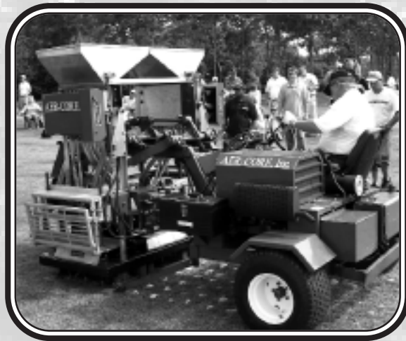
DRILL & FILL MACHINE; AER-CORE, INC.