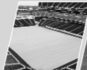
Covers for football and soccer fields are also readily available.