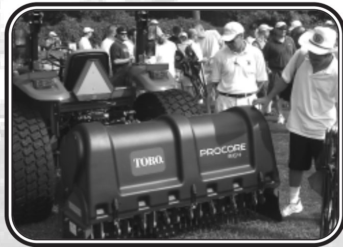
TORO PROCORE 864; STORR TRACTOR CO.