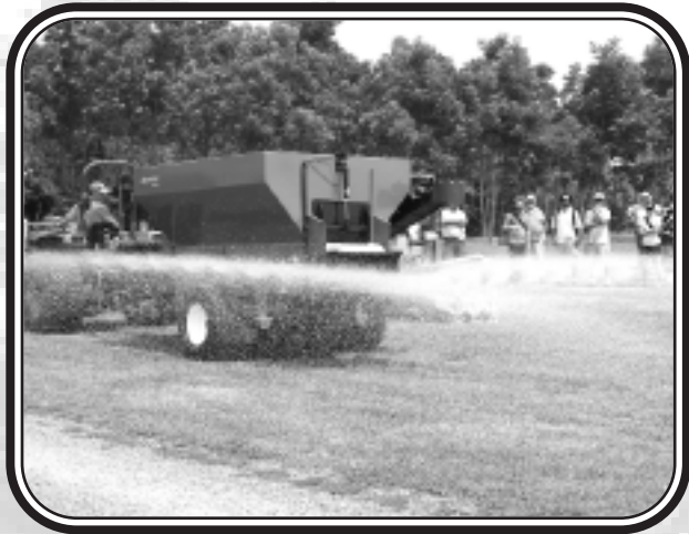
TURF-TIME TOPDRESSER; THE VIERSMA COMPANIES