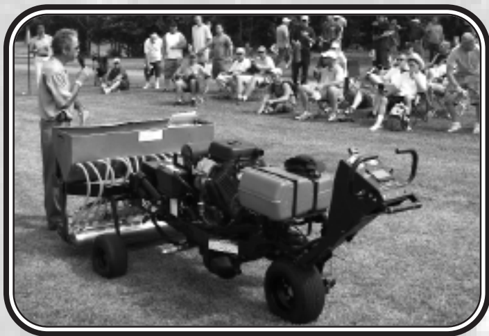
DRYJECT AERATION MACHINE; DRYJECT, INC.