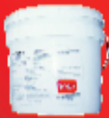
Toro® products available

Toro® just made line painting a whole lot better from start to finish. Introducing the Toro Line Painter 1200 with an innovative Express Clean System that cleans out up to 5-times faster. Meanwhile, its Floating Spray Head leaves consistent lines even on your roughest fields, spraying from the front, back, left or right. To find out more visit toroports.com/linepainter