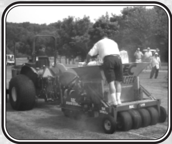
BLEC SANDMASTER SLICE AND FILL; AER-CORE, INC.