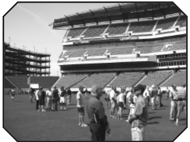
On-the-field at Lincoln Financial Field, Philadelphia, PA