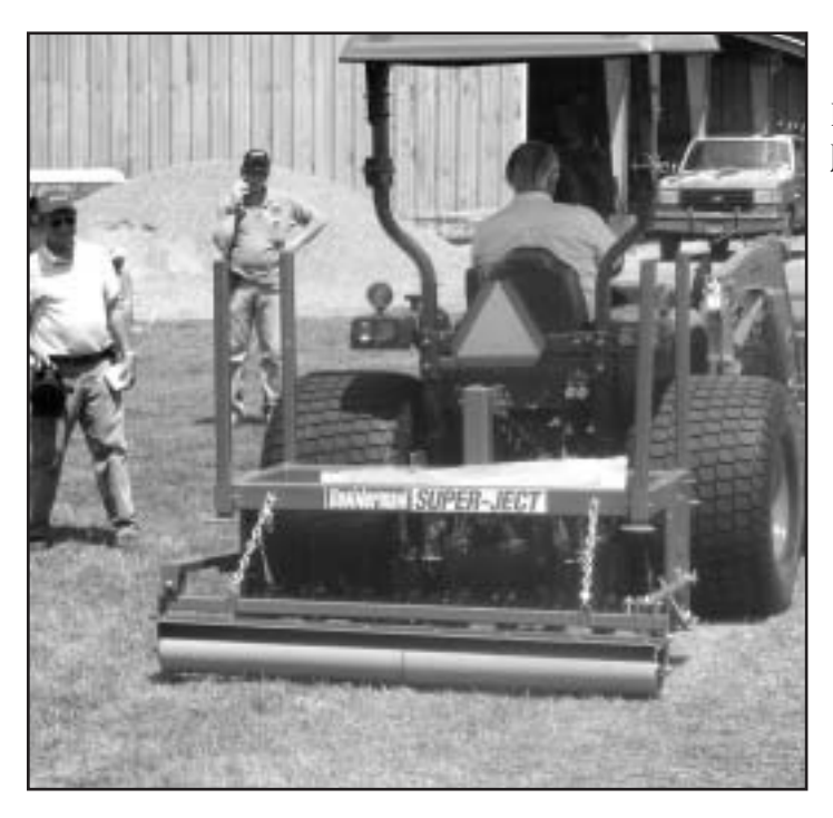
Bannerman Super-Ject; Jim Gates & Co., Inc.