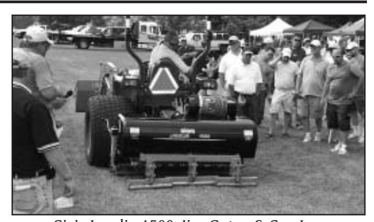
Sisis Javelin 1500; Jim Gates & Co., Inc.