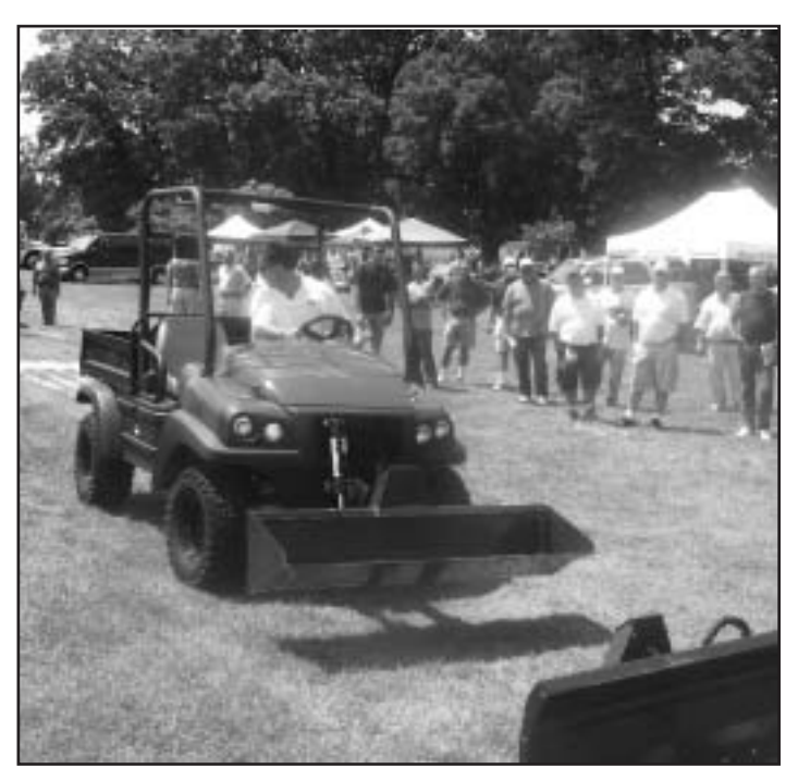
Club Car XRT 1550: Vic Gerard Golf Cars