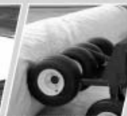
TARP MACHINE™ lets you roll the cover on and off in minutes.