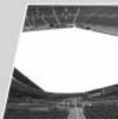
Covers for football and soccer fields are also readily available.