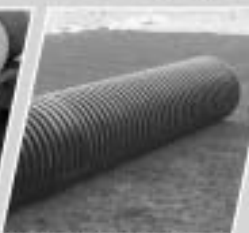
TARPMATE™ roller comes in 3 lengths with safety end caps.