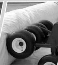
TARP MACHINE™ lets you roll the cover on and off in minutes.