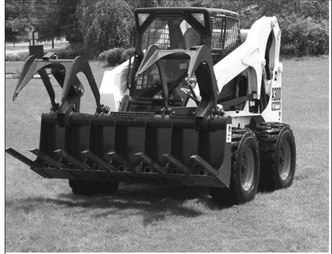
Bobcat of North Jersey was on-hand at the 2006 Summer Demonstration Field Day. The A300 Bobcat skid steer loader was demonstrated for the attendees.