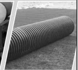
TARPMATE™ roller comes in 3 lengths with safety end caps.

COVERMASTER™ COVERMASTER COVERMASTER MASTERS IN THE ART OF SPORTS SURFACE COVERS