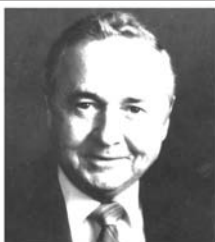
Dr. Henry W. Indyk Graduate Fellowship in Turfgrass Science

2006 SFMANJ Student Scholarship PO Box 370 Annandale, NJ 08801