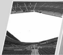
Covers for football and soccer fields are also readily available.