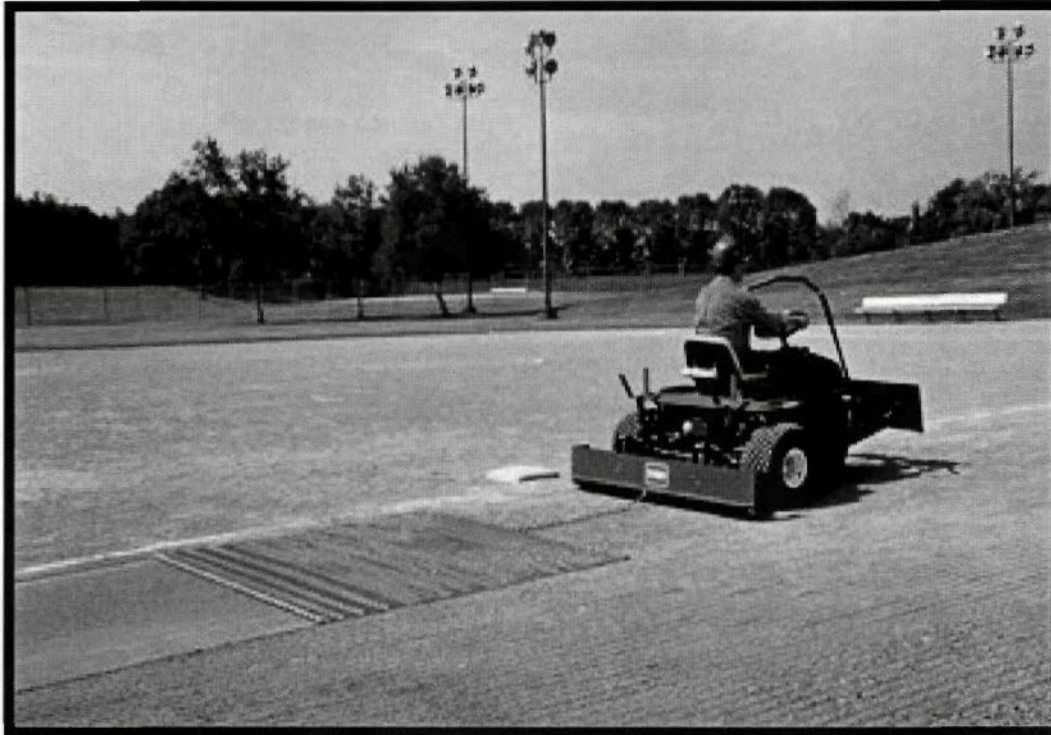
Toro's Infield Pro 5020