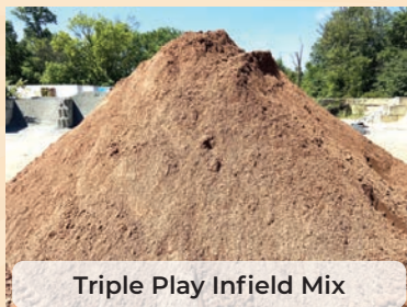
Triple Play Infield Mix