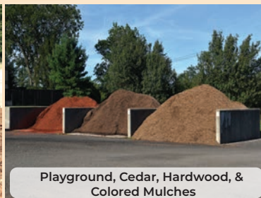
Playground, Cedar, Hardwood, & Colored Mulches