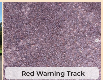
Red Warning Track