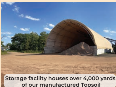
Storage facility houses over 4,000 yards of our manufactured Topsoil

Get top quality materials along with the quality service you expect