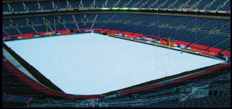
FOOTBALL FIELD COVERS are made of superior strength material, providing protection from rain or snow.

EVERGREEN<sup>™</sup> turf covers outsmart mother nature. Exclusive color lace coatings provide proven results.