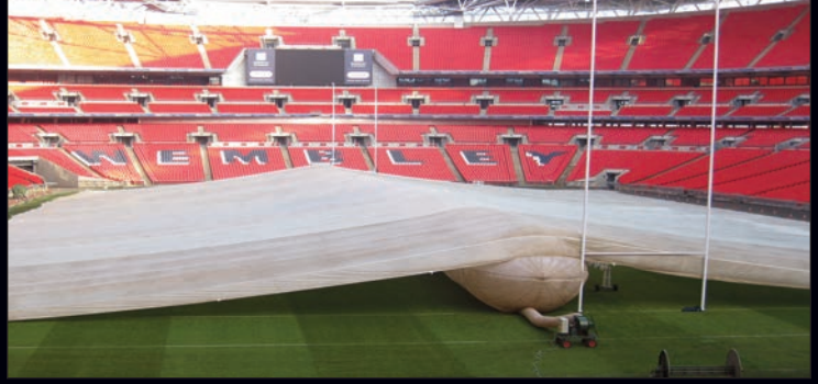
An INFLATABLE FIELD COVER allows for ongoing field maintenance during inclement and extreme cold weather.

TARPMATE<sup>™</sup> AIR roller is a revolutionary storage and handling system for field covers. 2-3 people can roll out or roll up a 100' wide cover.