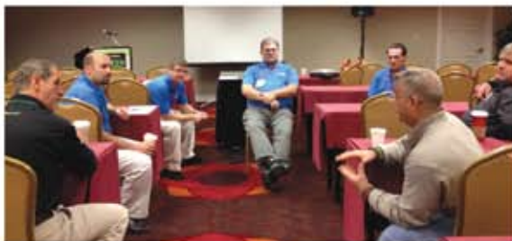
Early Bird Sports Field Managers