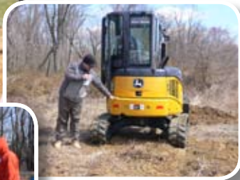
SPRING FIELD DAY No. Burlington County Regional High School Columbus, NJ April 2, 2013