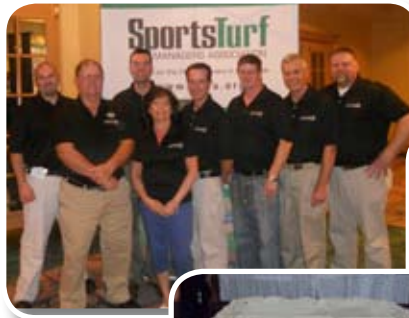
STMA ANNUAL CONFERENCE Daytona Beach, Florida January 2013