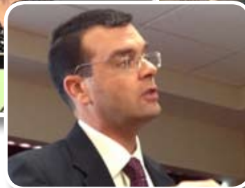
NEW JERSEY GREEN EXPO Trump Taj Mahal Atlantic City, NJ December 10-12, 2013