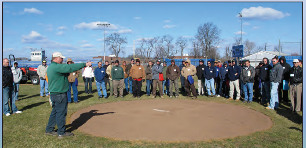
Practical sports field education was a part of the SFMANJ Spring Field Day at Northern Burlington Regional High School on April 2, 2013.