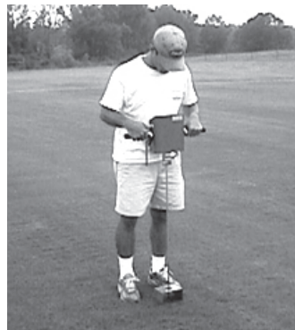
A Remik CP-20 cone penetrometer was used to measure the resistance of soil to the insertion of a probe.

from 1.3 to 1.8 g/cm 3 . At the upper end of these ranges the bulk density is great enough that root penetration may be inhibited. As comparison, the USGA recommendation for bulk density of putting green rootzone mix is 1.2 to 1.6 g/cm 3 . It's important to note that bulk density is highly variable from location to location. One sample will usually not be an indicator of the bulk density of an entire field or turf area.