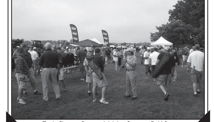
Trade Show at Rutgers Adelphia Summer Field Day