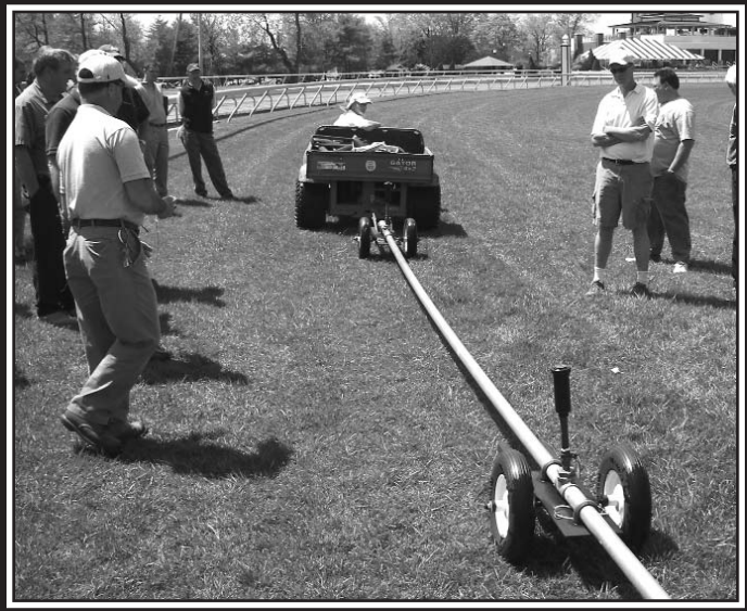
The complexities of irrigating Monmouth Park's oval-shaped thoroughbred turf track and a fixed inside rail necessitate the use of an innovative towline irrigation system.