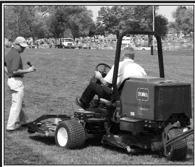
Toro Groundsmaster 3500-D; Storr Tractor Co.