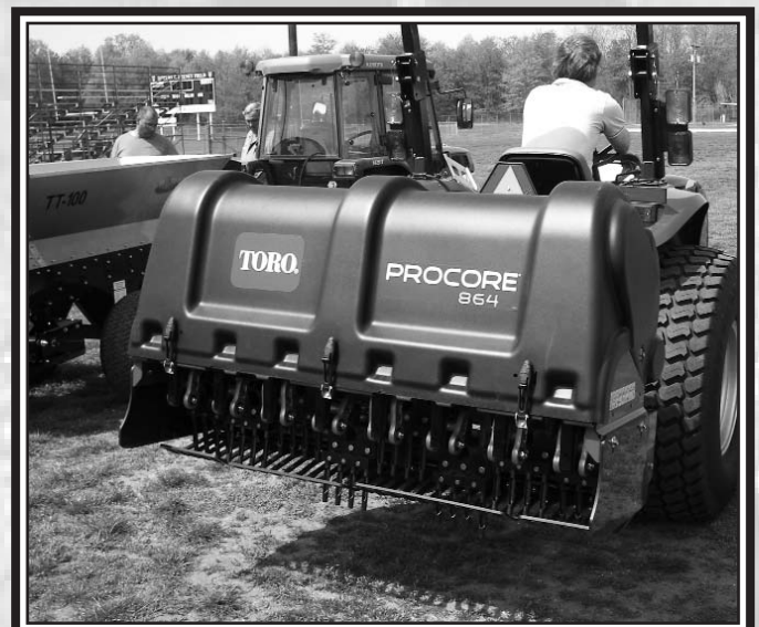
Toro Procore 864; Storr Tractor Co.