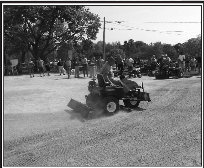
Smithco Super Star Infield Conditioner; Wilfred MacDonald, Inc.