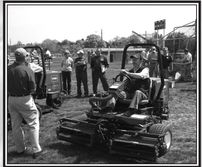
Toro Reelmaster 3100-D; Storr Tractor Co.