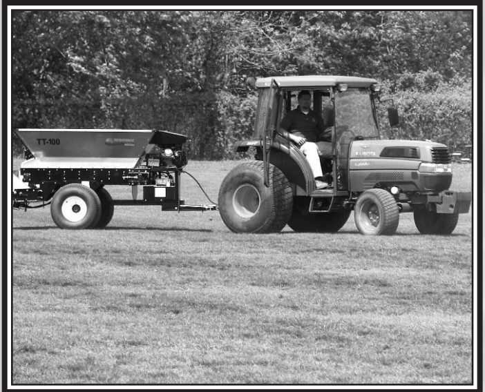
TurfTime Topdresser; The Viersma Companies