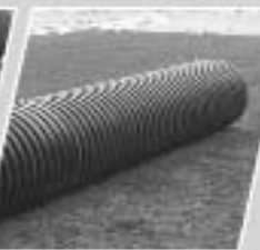
Covers for football and soccer fields are also readily available.