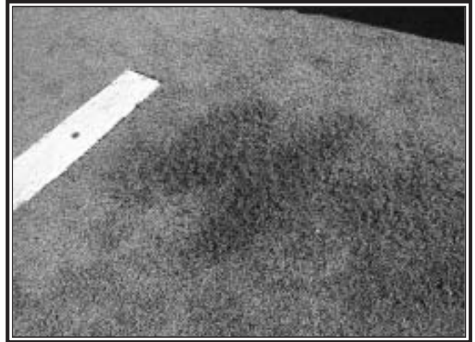
Significant fiber deterioration was evident directly in-front of the girls' softball pitching rubber.