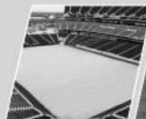
Covers for football and soccer fields are also readily available.