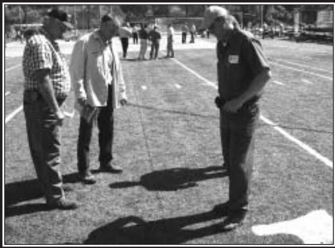
Not exactly seamless. District 4 Meeting attendees observe a large, not-easily-repairable seam in the playing surface of this synthetic infill system.