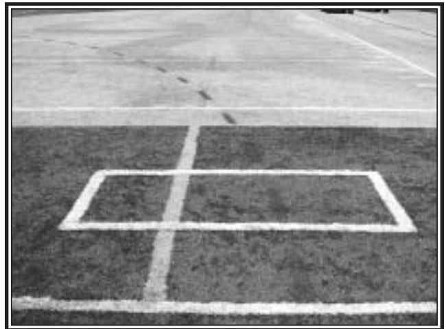
A multitude of permanently in-laid lines designating the playing areas for several sports, painted lines, and use of skin infield-colored carpet for a softball field all in one area creates a visually confusing surface.

EVERGREEN™ Turf Blankets... ...trusted around the world!