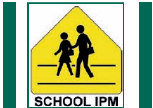
The New Jersey School IPM Law has been a source of confusion for many sports field managers responsible for school grounds in the Garden State. Expo 2006 has dedicated an entire afternoon session towards helping practitioners understand and conform to this law. The session will be held as part of the New Jersey Turf and Landscape Conference and Expo 2006 at the Trump Taj Mahal in Atlantic City. See inside for a complete schedule.